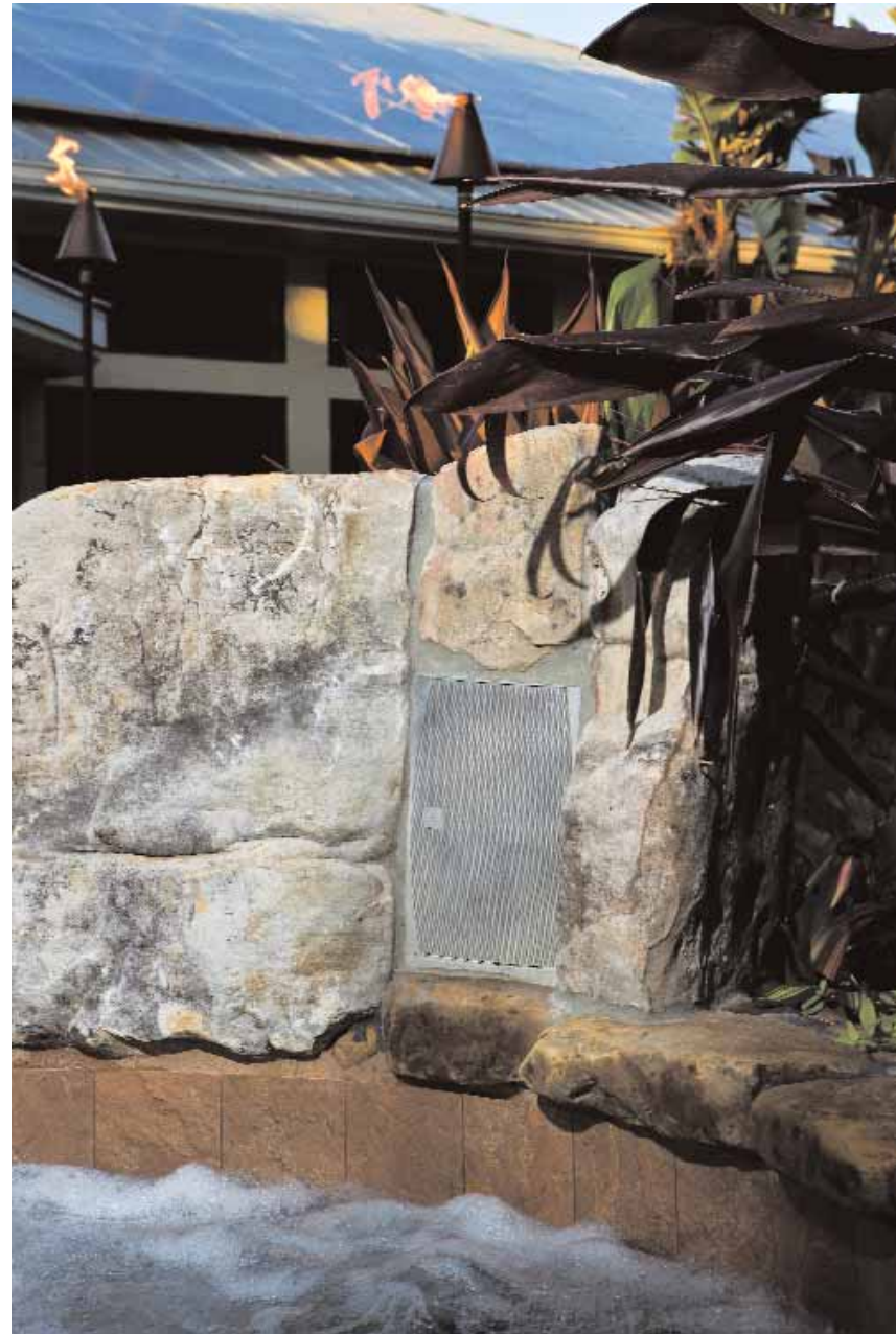
Music to the Jacuzzi in this Florida home flows out of Sonance Mariner 61 speakers that were grouted at the time the stonework was constructed, so the weather-hardy speakers appear to be part of the wall. System design and installation by Advanced Electrical Installations, Punta Gorda, FL.